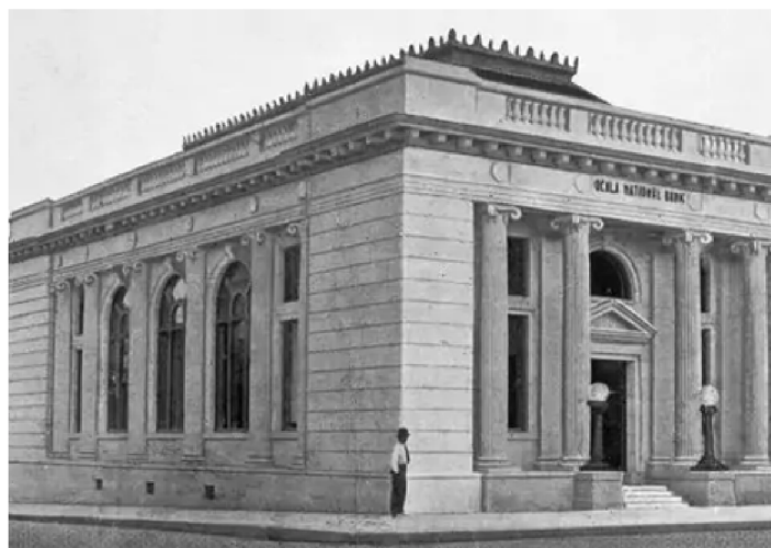
Ocala National Bank c.1914