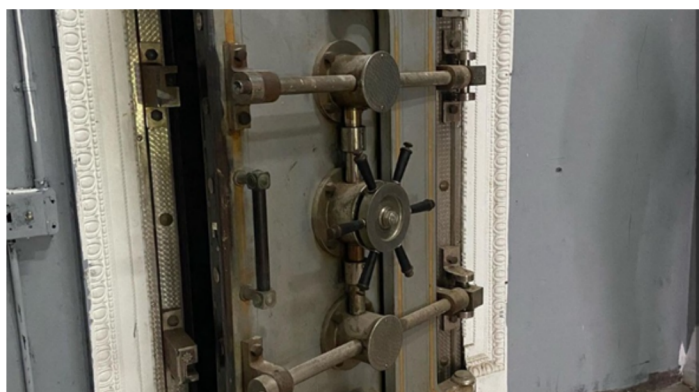
Large Vault Door Inside the Ocala National Bank

A PROJECT BROUGHT TO YOU BY OCALA MAIN STREET AND SPONSORED IN PART BY THE DEPARTMENT OF STATE, DIVISION OF HISTORICAL RESOURCES AND THE STATE OF FLORIDA