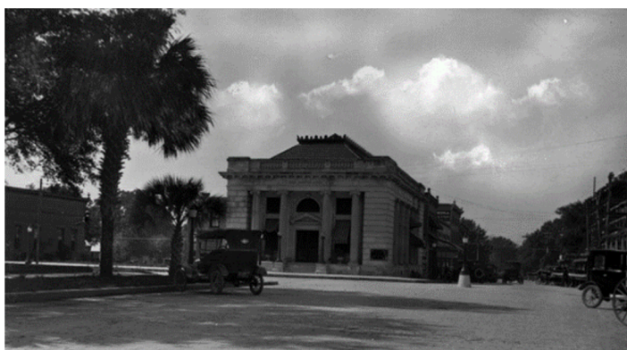
Ocala National Bank c.1900