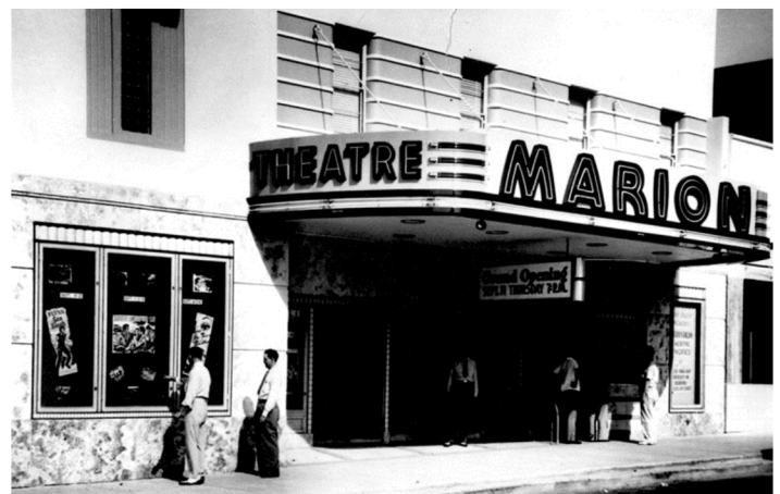
Marion Theatre the Day it Opened in 1941