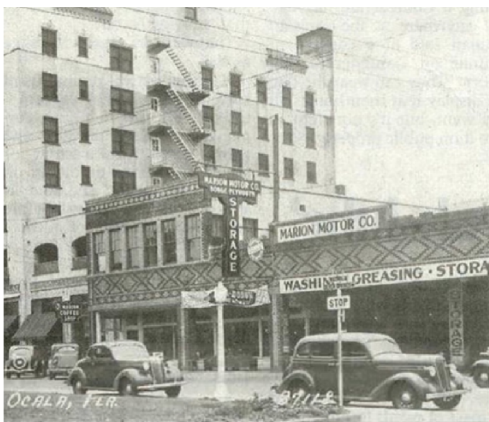
Studebaker Building as Marion Motor Co.

The building has been remodeled over the years and now houses the Mainstreet Community Bank. However, historic "ghost", a Studebaker sign, remains on the back exterior of the building facing the courthouse.