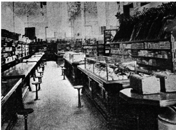
Interior of Rheinauer Original Store c.1890

The Rheinauer Block storefront, though only 42 feet in width, is 115 feet deep. The interior design featured modern décor for its time in lighting, wainscoting, and also a center arcade with glass skylight. The Rheinauer store remained downtown in this building for over 50 years, and then relocated to the Ocala Shopping Center in 1997. Rheinauer and Company operated as an Ocala retail business for 117 years. This is now the home to Grandpa Joe's Candy Store.