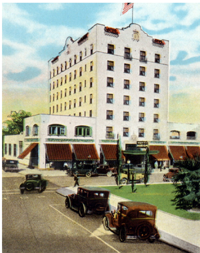
Marion Hotel c.1900