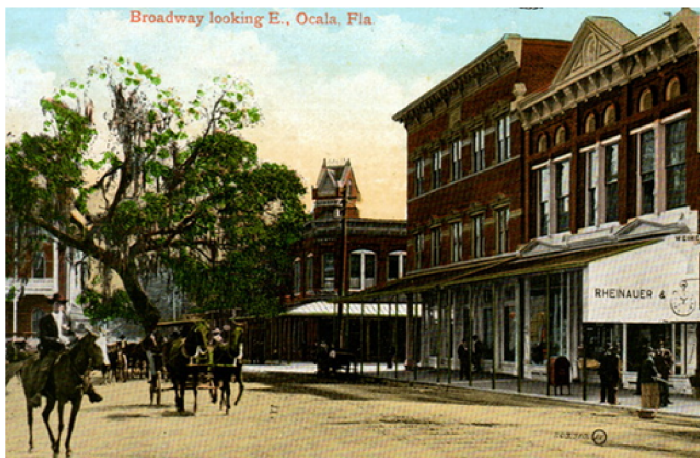
Marion Block c.1908

By 1908, the building was sold and renamed Holder Block. At this time, the entire second and third floors of the building were being used as professional offices. By 1940, it was again identified and referred to by its original name, Marion Block. Now, the building houses offices on the second and third floors, and the block is home to Harry's Seafood, Bar & Grille.