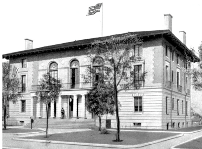
Post Office c. 1920

A PROJECT BROUGHT TO YOU BY OCALA MAIN STREET AND SPONSORED IN PART BY THE DEPARTMENT OF STATE, DIVISION OF HISTORICAL RESOURCES AND THE STATE OF FLORIDA