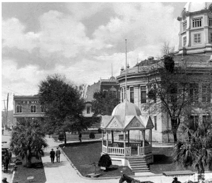
Downtown Square, Gazebo & Courthouse c.1900

In the 1960s, a fifth courthouse was built on a different site. In 1965, after public efforts to save the historic courthouse failed, it was demolished. The County Commissioners gave the site to the City of Ocala, retaining its function as a Public Square.